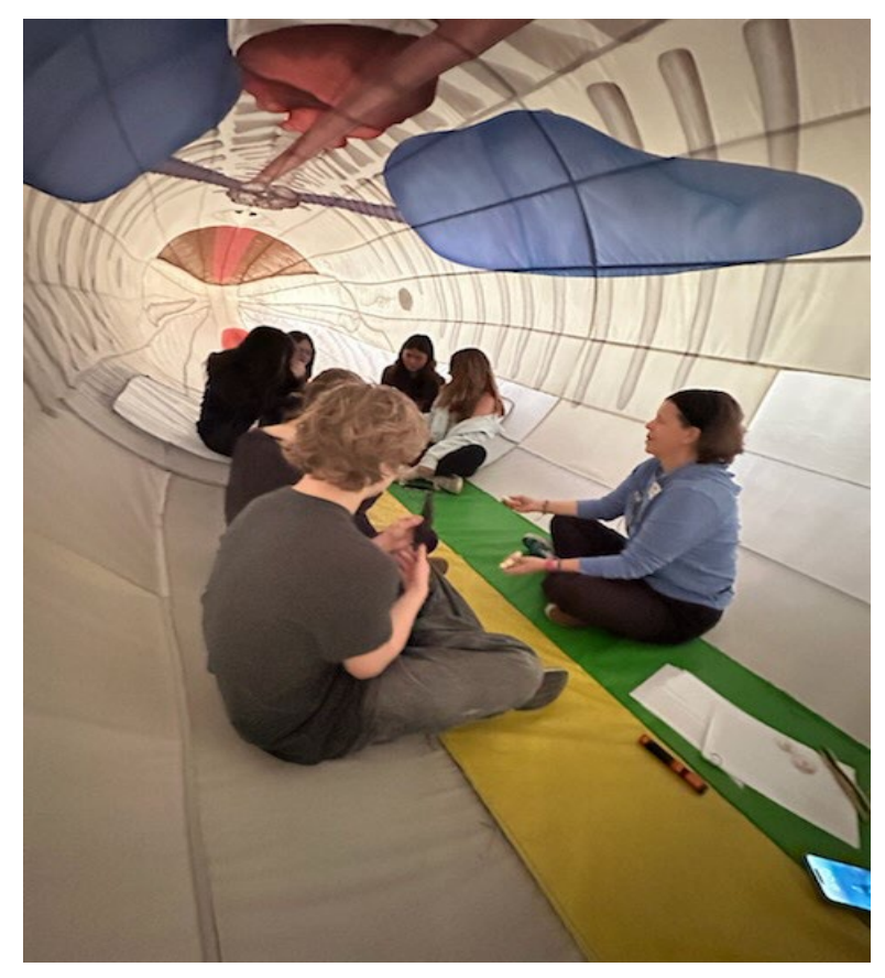
Tennis Court Update